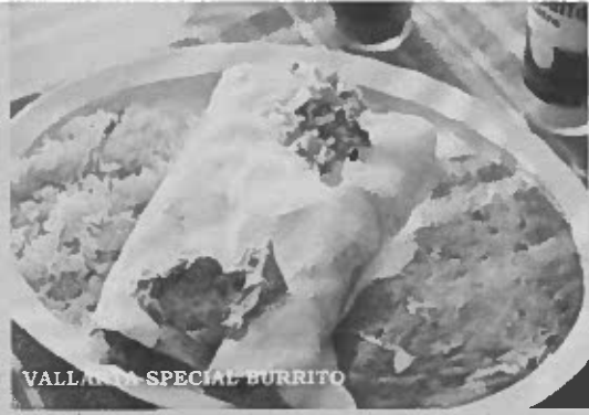
VALLARTA SPECIAL BURRITO