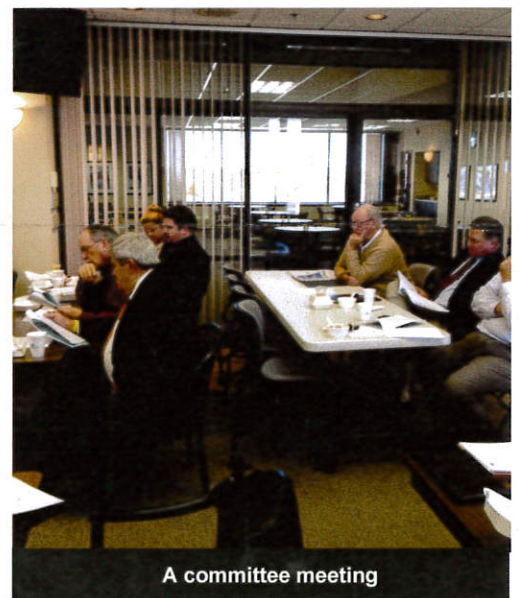
A committee meeting