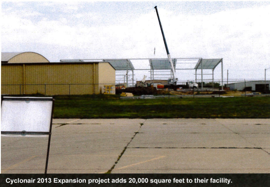
Cyclonair 2013 Expansion project adds 20,000 square feet to their facility.