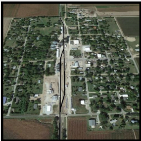
Village of Benedict