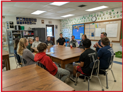
Below: AI Lunch & Learn