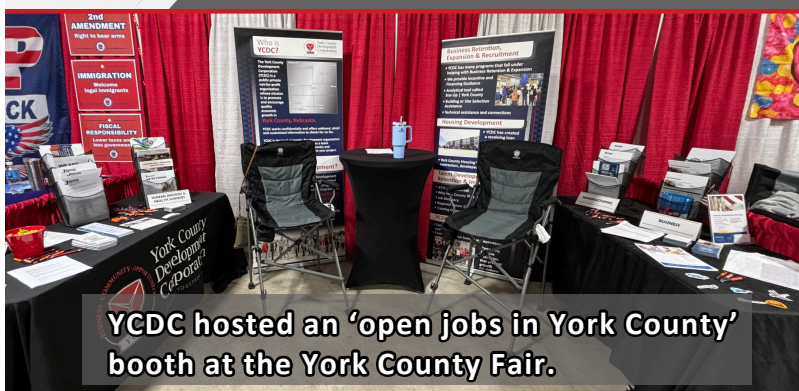
YCDC hosted an 'open jobs in York County' booth at the York County Fair.