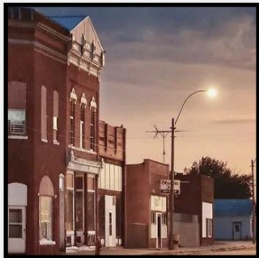
Village of Gresham