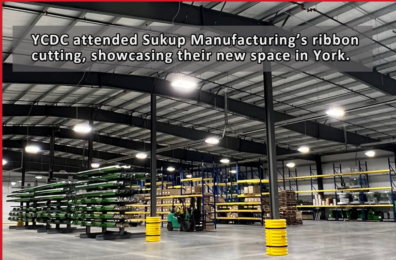
YCDC attended Sukup Manufacturing's ribbon cutting, showcasing their new space in York.