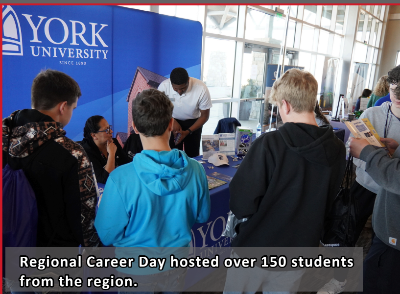
Regional Career Day hosted over 150 students from the region.