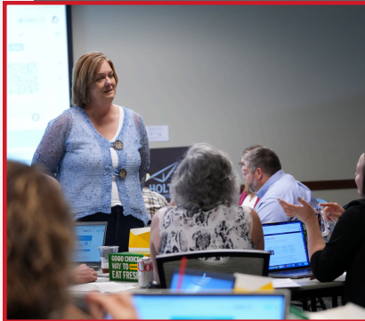
Below: Strategies and Statistics to aid us in strengthening our workforce Lunch & Learn