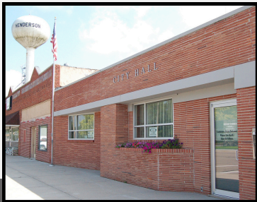
City of Henderson