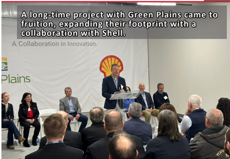
A long-time project with Green Plains came to fruition, expanding their footprint with a collaboration with Shell.