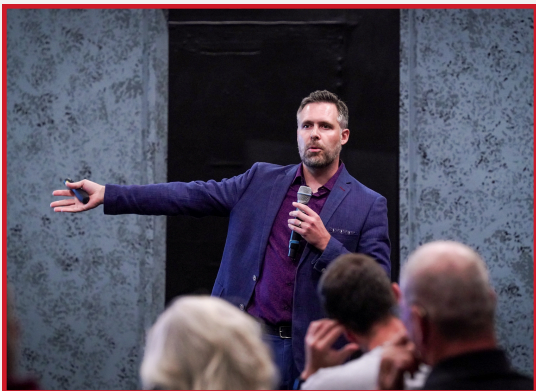
Below: BetterCulture event in partnership with York University

$5,000+ (Titanium): Established business. Receives a board seat if desired and gets a 30 second commercial on 17-County Podcast.