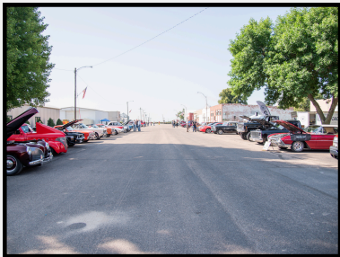
Village of Bradshaw