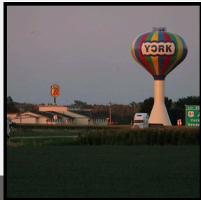
City of York