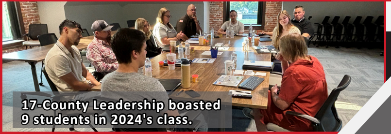
17-County Leadership boasted 9 students in 2024's class.