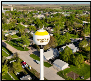
Village of McCool Junction