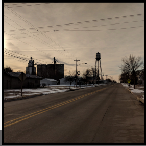
Village of Waco