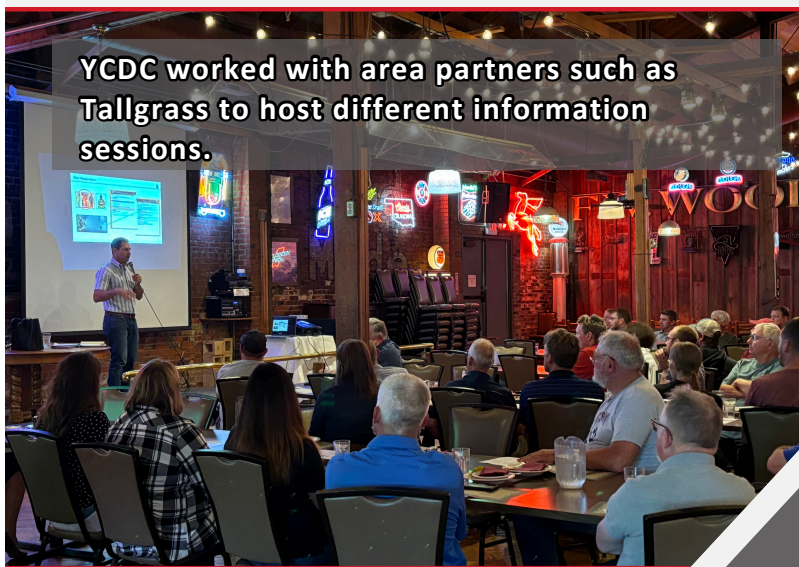
YCDC worked with area partners such as Tallgrass to host different information sessions.