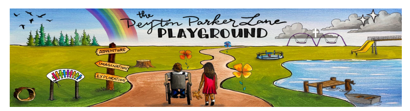
All-Inclusive, Parallel Play, Playground, York, Nebraska